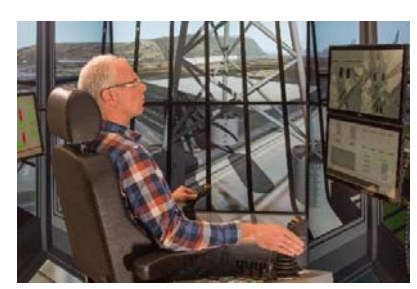
Interactive training simulator